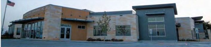
Lynette Electric Cooperative Headquarters - Tahoka, Texas