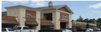
Moore's Furniture Renovation - Kerrville, TX