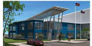
XCOR Corporate Headquarters - R&D Facility, Midland International Airport