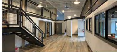
Welborn Engineering - 631 Water Street, Kerrville, TX