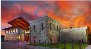
Blanco County - Historic Jail Restoration & County Offices - Johnson City, TX