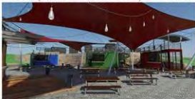
G12 Site Rendering - Kerrville, Texas