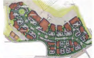
Midland International Airport and Spaceport